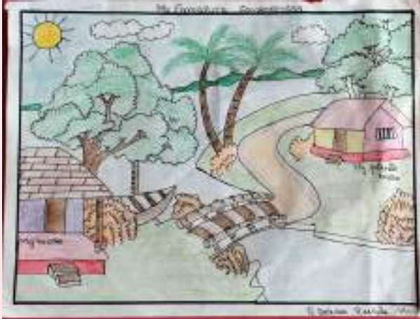
Aazeen Rushda - 7B