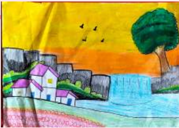
Aakifa - 7B