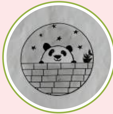
Ayisha Neha - 7B