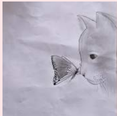
Ridha - 8B