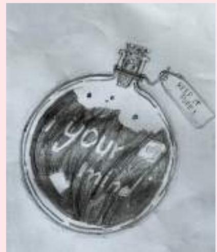
Zara Ridha- 8B