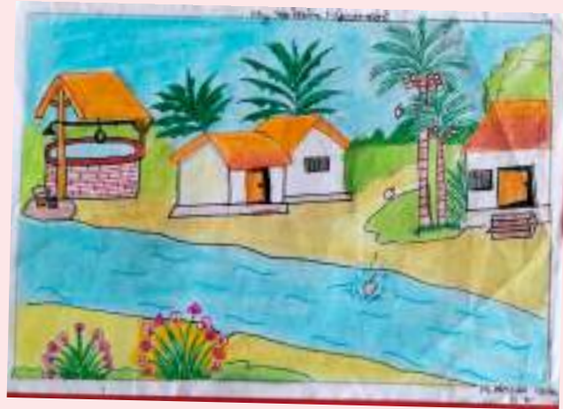
Ayisha Neha - 7B