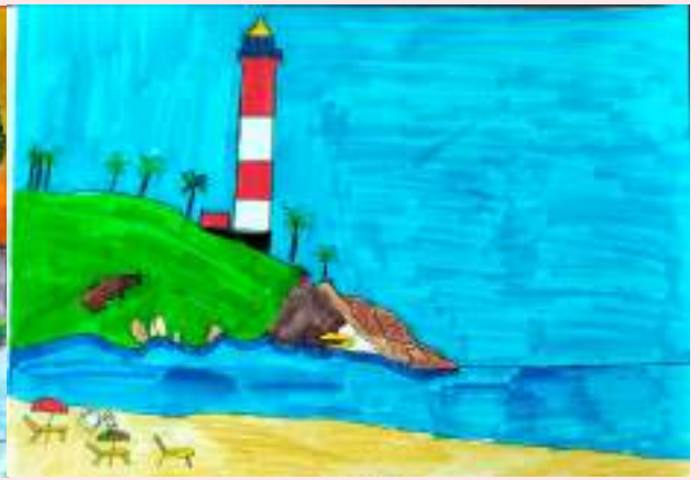
Minan Mallick - 7A