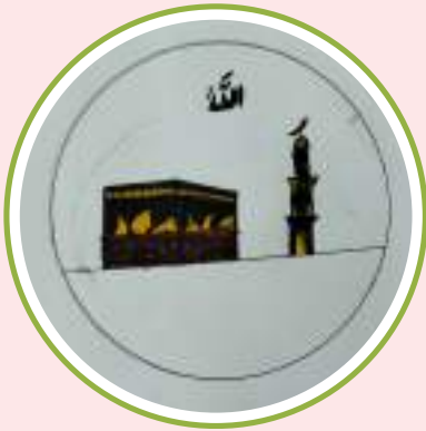
Mohammed Vaseem - 7A